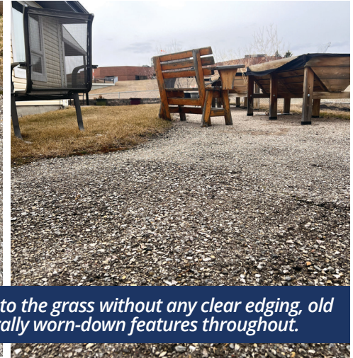
Cracked pavement, uneven ground that blends directly into the grass without any clear edging, old patio furniture, limited space for activities, and generally worn-down features throughout.