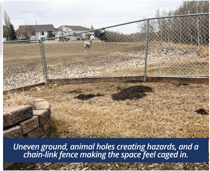
Uneven ground, animal holes creating hazards, and a chain-link fence making the space feel caged in.

This project would create a safe, secure, and welcoming outdoor environment that encourages fresh air, movement, connection, and meaningful engagement with nature.